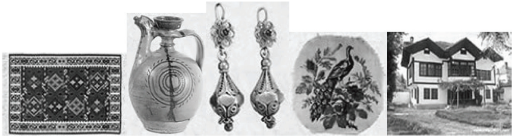
Figure 4. Old handicrafts and ethno-architecture of Pirot area

(silversmiths), which had been developed from Middle Age to the beginning of the XX century, then embroidery, etc. There should also add ethno architecture and ethno manifestations, where promotes rich spiritual inheritance of this region – music, food, folklore, customs ("Molitva pod Midžorom", "Sabor na Kadibogazu", "Sabor na Panadžur"...).