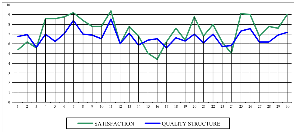
Figure 2. Relationship between qualification structure and guest satisfaction

Analysis of total qualification structure index of employees within hospitality facilities and guest satisfaction showed some deviation in the restaurants no. 15, 16 and 24, where guest satisfaction is below the average for the qualification structure of employees ( Figure 2 ).