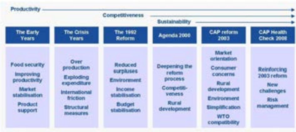
Chart 2. Historical development of the CAP