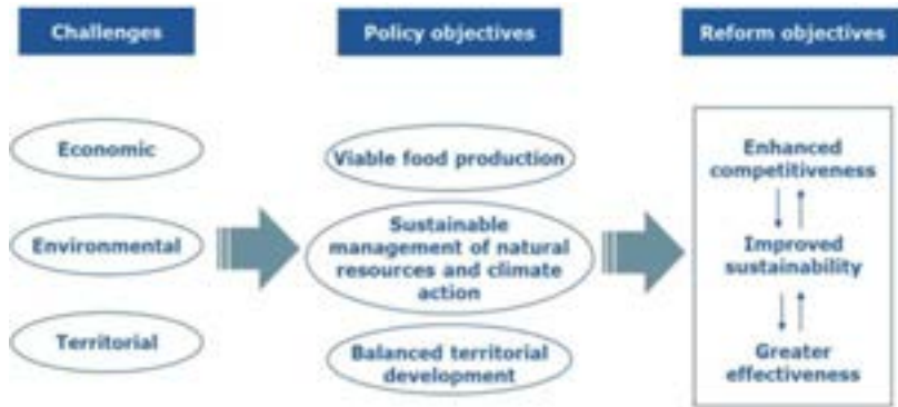
Chart 3. The CAP post-2013: From challenges to reform objectives

Source: European commission, DG Agriculture and Rural Development.