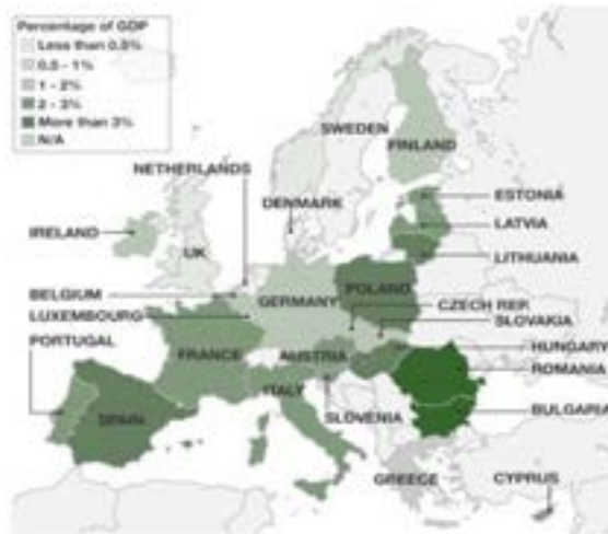
Chart 1. Importance of agriculture in the economy

Specific treatment of agriculture is logical bearing in mind that this sector is essential for human survival ( Chart 1 ). Therefore, protective measures are necessary. Agriculture is important from the standpoint of food security for the population. In this way, agriculture satisfies the essential, basic human needs. The key objectives of the strategy of agricultural development of any country are ensuring food security for consumers, self-sufficiency in food and variety and quality range of products.