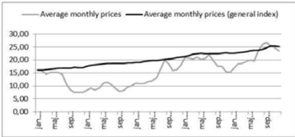
Graph 2. Movements of Average Monthly Maize Prices on Commodity Exchange