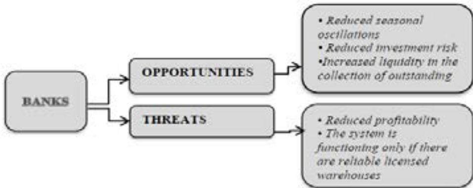
Picture 1. Opportunities and Threats for Banks Trading in Warehouse Receipts

Implementation of the Public Warehouses System and using the warehouse receipts as collateral or as a security paper in trading on the Commodity Exchange carries both opportunities and threats, for all the participants in the system chain. Some of them are listed below: