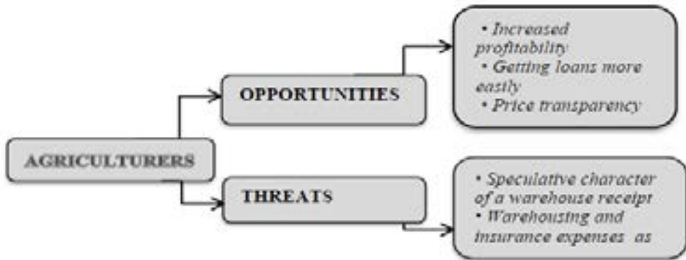
Picture 2. Opportunities and Threats for Agriculturers Trading in Warehouse Receipts