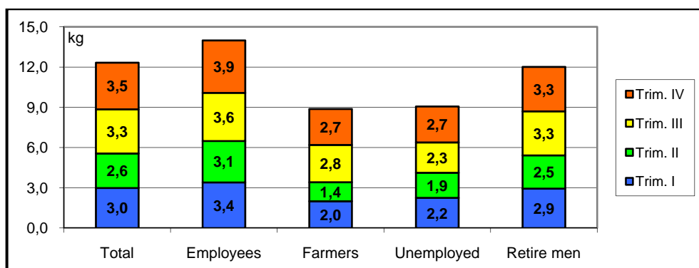
Figure 1 Average consumption of fruits by categories of households, year 2007 (kg/month/person)