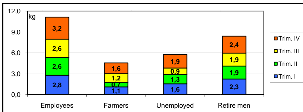
Figure 2 Purchased quantities of fresh and processed fruits, by categories of households (Kg/month/prs.)