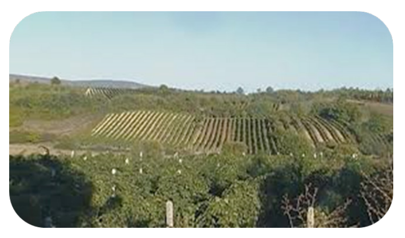
Figure 1: Panorama of the Orahovac vineyards.

Some of the most famous wineries on the ninth of the marked wine routes in Serbia are Vinica Petrović from Velika Hoča, as well as Antić winery from Orahovac. They make wine using Italian Riesling, the Rhein Riesling, Red Burgundy, Vranac, Sauvignon and Cabernet sorts (Serbia.com).