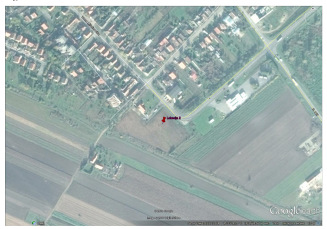
Figure 4. Location